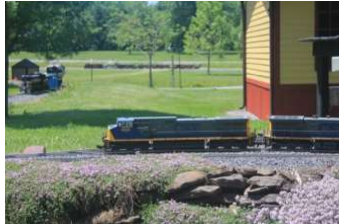
This location is the only location where you can photograph all three layouts in one shot.